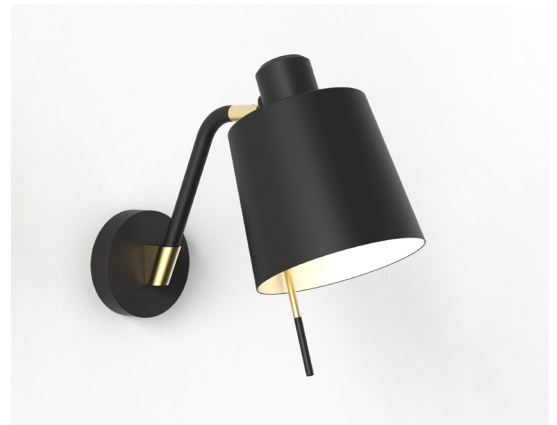
CODE: 1441001 FINISH: MATT BLACK

TO MAINTAIN THIS PRODUCT TO ITS BEST CONDITION, PLEASE VIEW OUR CARE AND CLEANING GUIDE ON THE SUPPORT SECTION OF THE ASTRO WEBSITE.