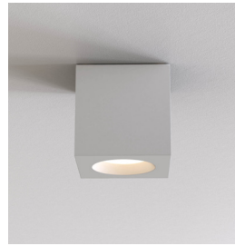
CODE: 1326043 FINISH: MATT WHITE