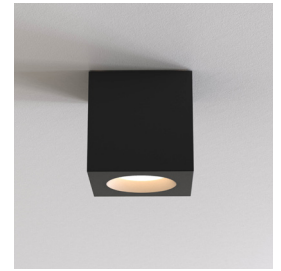
CODE: 1326044 FINISH: TEXTURED BLACK