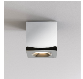
CODE: 1326046 FINISH: POLISHED CHROME

TO MAINTAIN THIS PRODUCT TO ITS BEST CONDITION, PLEASE VIEW OUR CARE AND CLEANING GUIDE ON THE SUPPORT SECTION OF THE ASTRO WEBSITE.