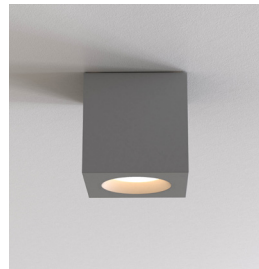
CODE: 1326045 FINISH: TEXTURED GREY